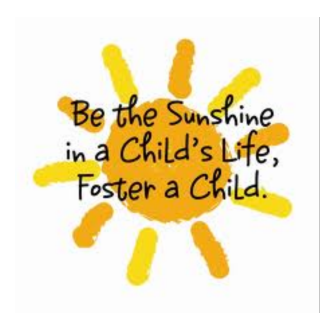
Volume 25: Number 1 Feb/Mar 2017

Phone: 907 435-3252 Email: <u>scuster@svt.org</u>