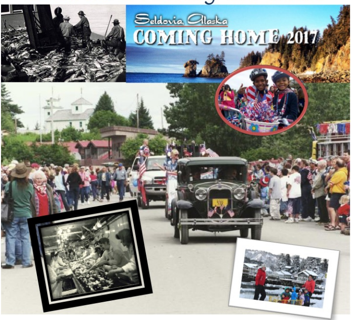
Have original photos that you would like to be scanned and shared? We'd be glad to scan the photos and return the originals to you. Mail them to Seldovia Village Tribe, PO Drawer L, Seldovia, AK 99663.

Help Us Record Seldovia's History in Photos