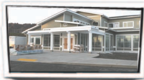
Entrance view of building.

"Compassionate Care For Our Communities."