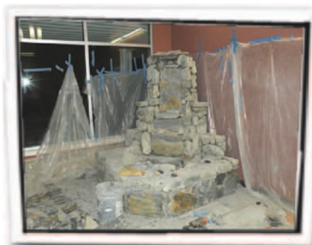
Waterfall in waiting room area.