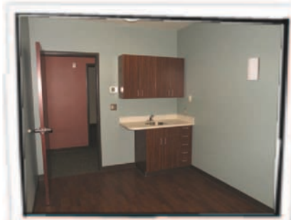
Exam room layout.