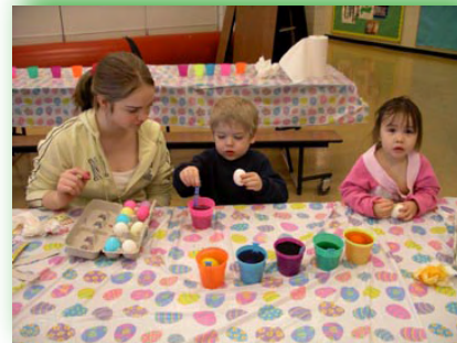
Preschool Egg Hunt