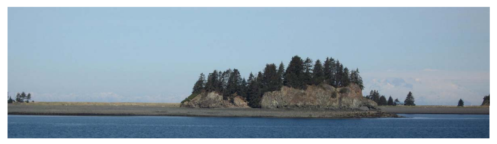
We would love to see you all come home this Summer.